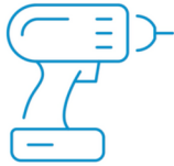
Drill With 5/64" Bit